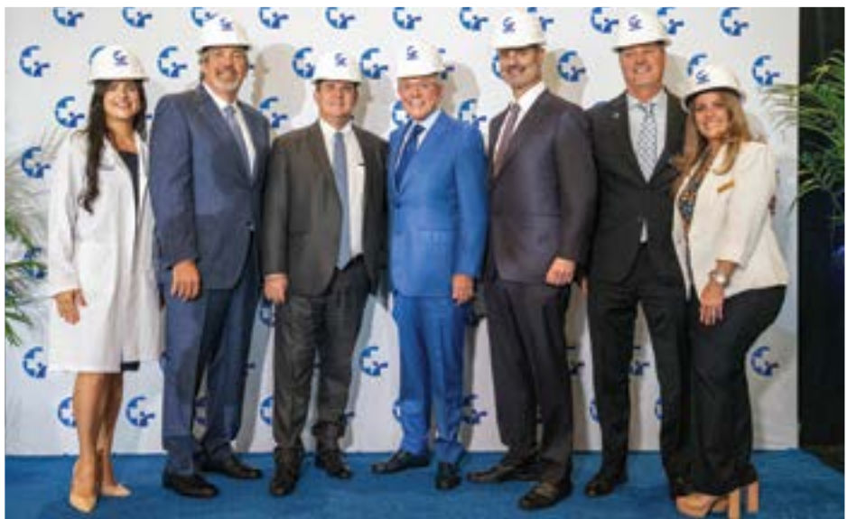
LEFT TO RIGHT

Once opened, the center will provide world-class medical service by a fully bilingual staff and physicians. to nearly 6,000 Medicare patients throughout the City of Homestead and South Dade area, operate 7 days a week, and offer complimentary transportation. For more information on Leon Medical Centers contact 305-642-5366 or search https://leonmedicalcenters.com/ .